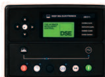
DSE871X MONO REMOTE DISPLAY MODULE