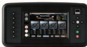
DSE8721 COLOUR REMOTE DISPLAY MODULE